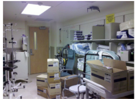
Equipment room before