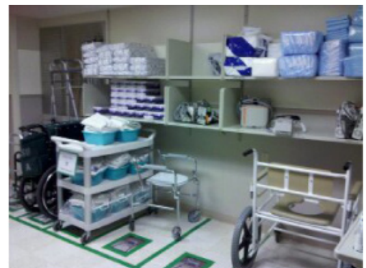
Equipment room after

Created by the National Health Service's Institute for Innovation and Improvement in England, Releasing Time to Care has spread to Canada, Australia, New Zealand, Ireland, Scotland, Wales, Denmark, Netherlands and now the U.S.